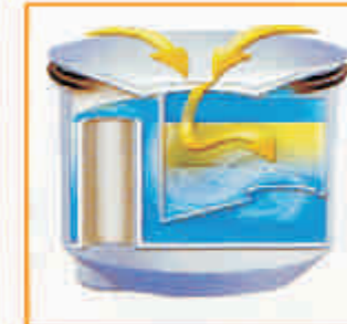
...AND HOW URINE PASSES THROUGH IT, BECOMING