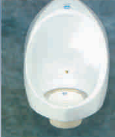
Vitreous China "Freesia"