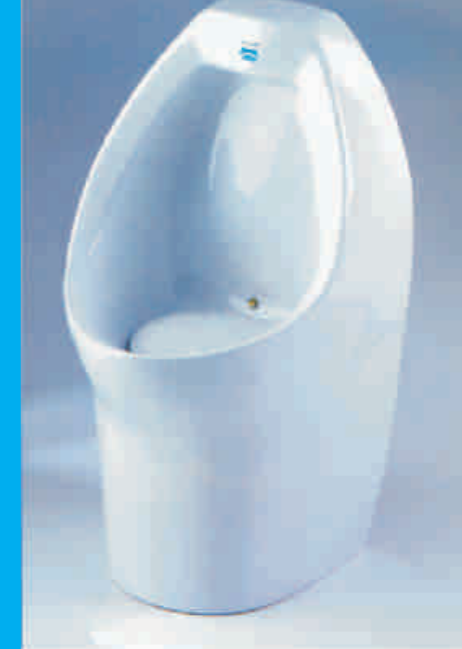
Vitreous China "Flax"

Constructed from vitreous china or fibreglass reinforced plastic, the urinal has a special gel coating making it totally resistant to urine accumulation and bacteria residue.