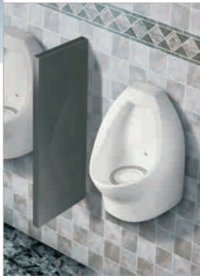
"Flax" with Privacy Divider