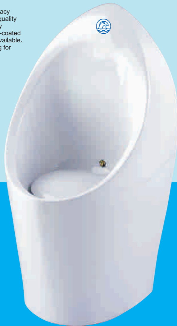
Vitreous China "Boronia"

The urinals, with optional privacy dividers are made from high quality white vitreous china for facility aesthetics. Black or white gel-coated Fibreglass models are also available. Units have special gel coating for improved hygiene.