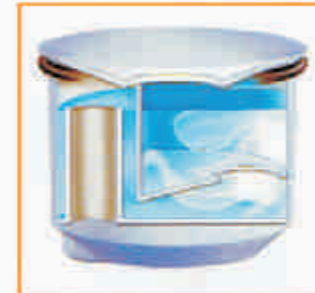
DIAGRAMS ILLUSTRATE HOW LIQUID SEALANT FLOATS ON WATER...

UNIQUE CARTRIDGE DESIGN REQUIRES NO ADDITION OF SEALANT BETWEEN CHANGES